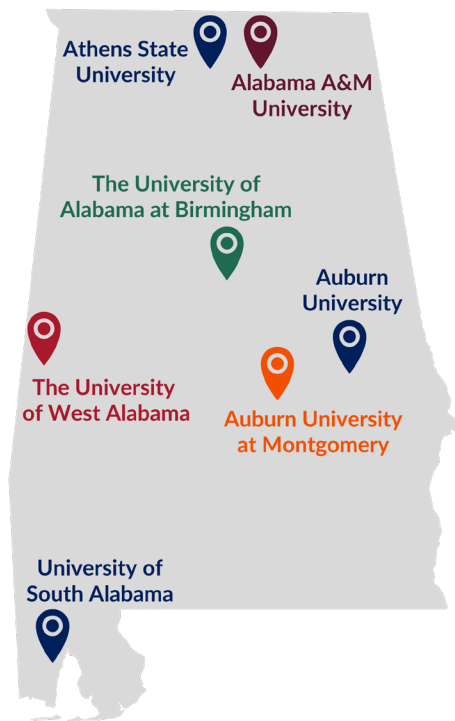
Alabama universities with UTeach programs span every region of the state.

Athens State TEACH student at Athens State University